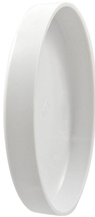
4817-T 1½ - 6"