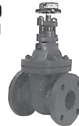
F-619-SO Flanged With Square Op. Nut