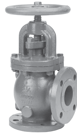
F-838-31 Flanged-Raised Face

Consult Factory for non-return feature. Fig. No. F-838-31NR.