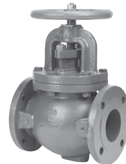
F-738-31 Flanged-Raised Face

2 2" thru 6" have Bronze ASTM B 584 Disc. 8" thru 10" have Ductile Iron Disc with Bronze ASTM B 584 Disc Face Rings and Brass Pilots.